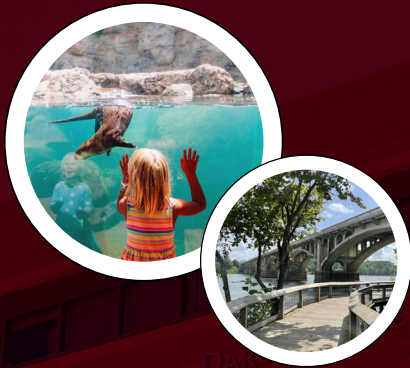
RIVERBANKS ZOO AND GARDEN and COLUMBIA RIVERWALK