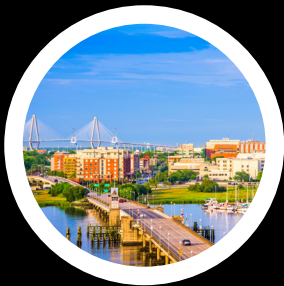
CHARLESTON, SOUTH CAROLINA