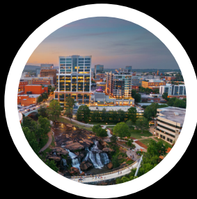
GREENVILLE, SOUTH CAROLINA