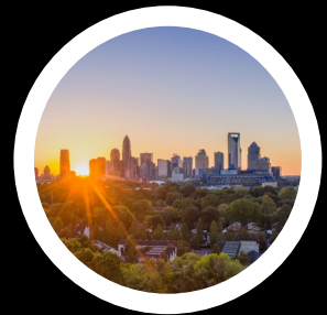
CHARLOTTE, NORTH CAROLINA