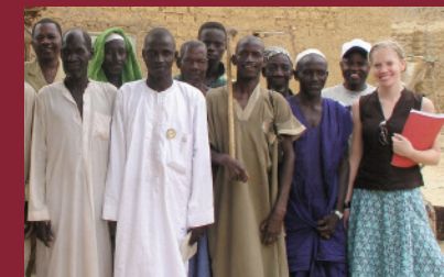
2006: Master of International Business Studies (MIBS) student in Africa with local community leaders