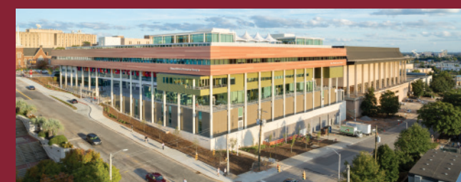
2014: The Darla Moore School of Business at the time of the grand opening