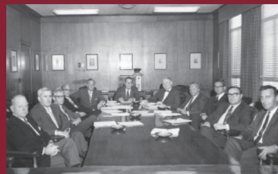
1969: The founding members of the Business Partnership Foundation