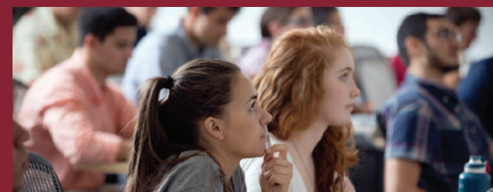
Moore School students today