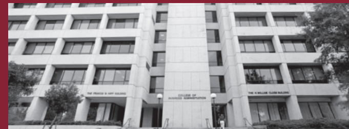
1983: Completed Close-Hipp Building