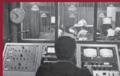
1970: The MBA-ETV studio and classroom