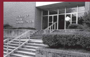
1955: The new School of Business Administration building (now Callcott Social Sciences Center)