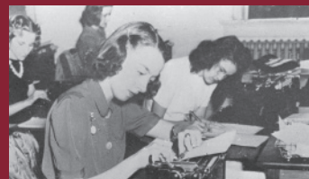
1941: Typing class