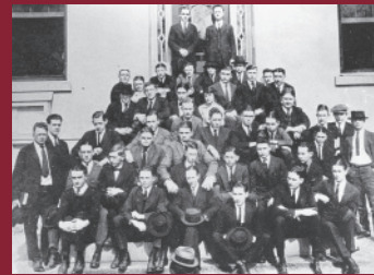
1922: School of Commerce students, including the nine students that made up the first graduating class in 1923