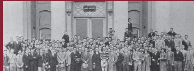
1926: School of Commerce students gather outside of Davis College for a photo