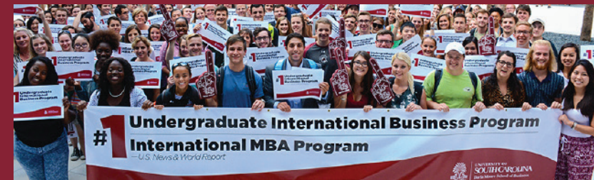
2016: Students celebrating another year of ranking No. 1 in international business