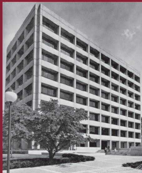
1973: H. William Close Building